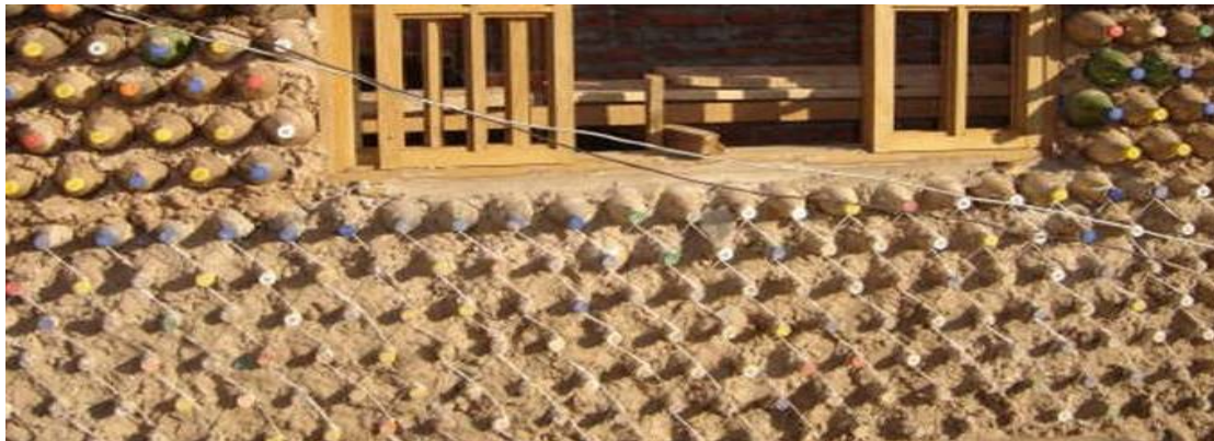
fig.1: showing brick replacing PET bottles

Method of replacing bricks with PET bottles only. Before using PET bottle, it is filled with soil or ash in the bottle.